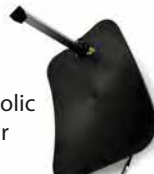
Extended distance sensor