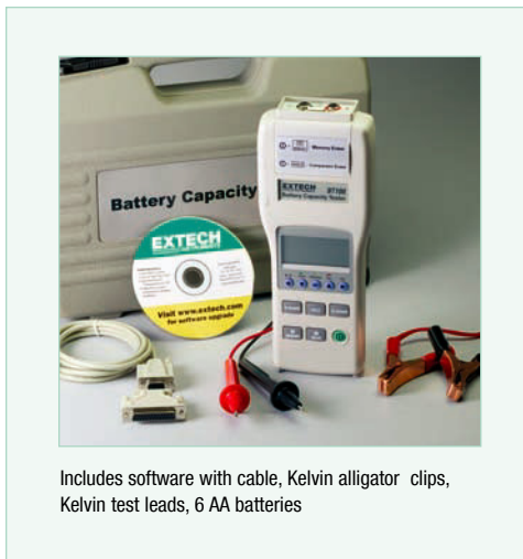
Includes software with cable, Kelvin alligator clips, Kelvin test leads, 6 AA batteries